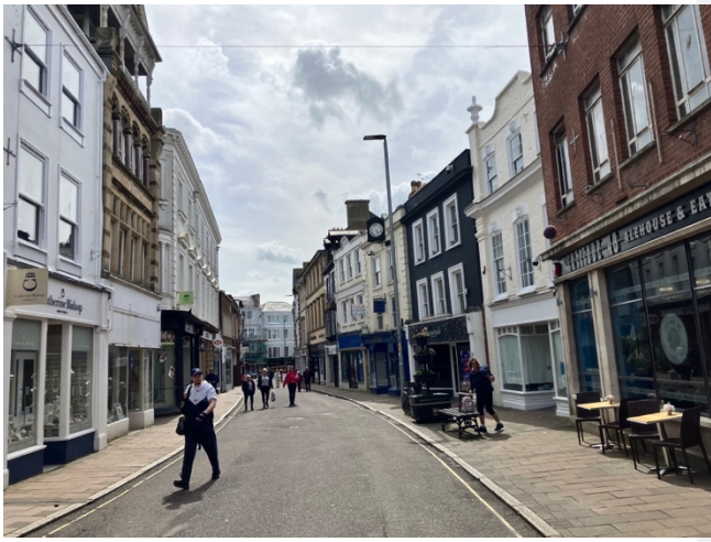
97 High Street Barnstaple Ground Floor Plan & photos