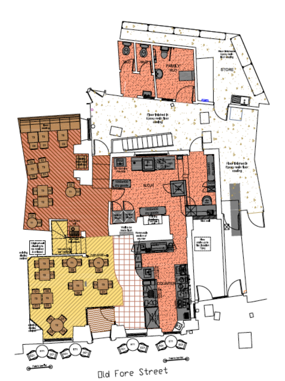
First Floor sales/ancillary