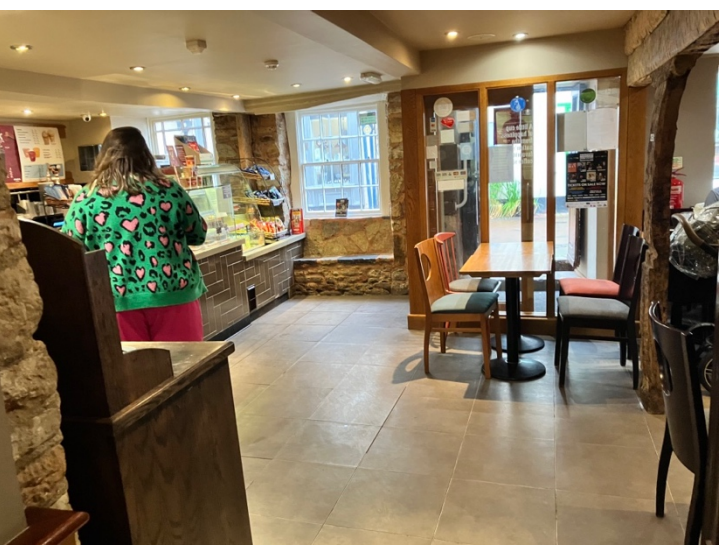
Ground Floor front of house