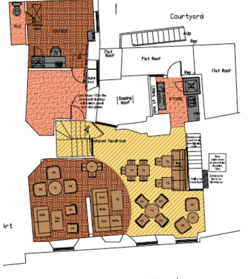
Old Fore Street