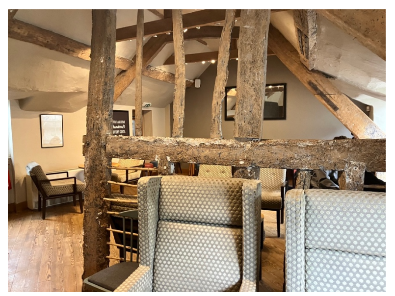
First Floor Sales